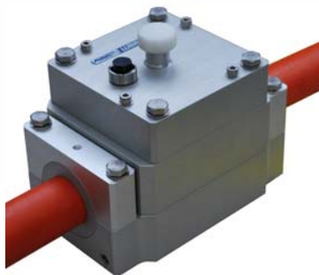
Lubricator L18, for the continuous lubrication of cables for a better Jetting performance