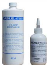
Jetting Lube / Micro Jetting Lube, lubricant improving Jetting performance