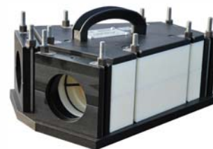
Y-connector, for the installation of cable into an occupied duct