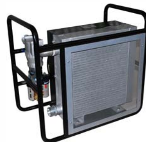
Air after-cooler, to increase Jetting performances when ambient temperature is over 20°C