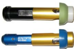
Sonic head, for the installation of cables with low stiffness