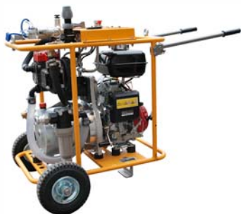
Hydrocab-010, accessory for cable installation in micro-ducts with water (floating), 10 l/min