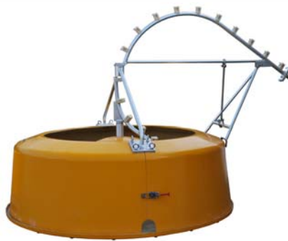
Figaro / Figarino, intermediate cable storage system, avoiding figure of 8