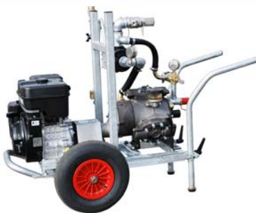
Hydrocab-080, accessory for cable installation with water (floating), 80 l/min